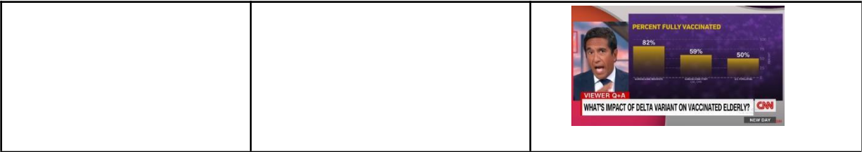
Tabel 1. The truth about the Delta variant: Dr. Gupta answers your questions

Based on the data above, the writer analyzes Syntax, Script, Thematic, and Rhetorical structure. The first is from Syntax structure, the uploader or a journalist gives the headlines as “The truth about the Delta variant: Dr. Gupta answers your questions”. Undeniable appearance of the new variant of Covid-19 it is Delta makes a lot of questions and fright to society. And in this news video, Dr. Sanjay Gupta answers some questions about Delta and other questions about pandemic. At the beginning of the video as a lead of the video Dr. Gusta explains that elderly people in the nursing home are more susceptible to getting the virus, in the middle of the video he gives some way of prevention and in the closing he states that getting vaccinated is the best way to prevent Delta variant.